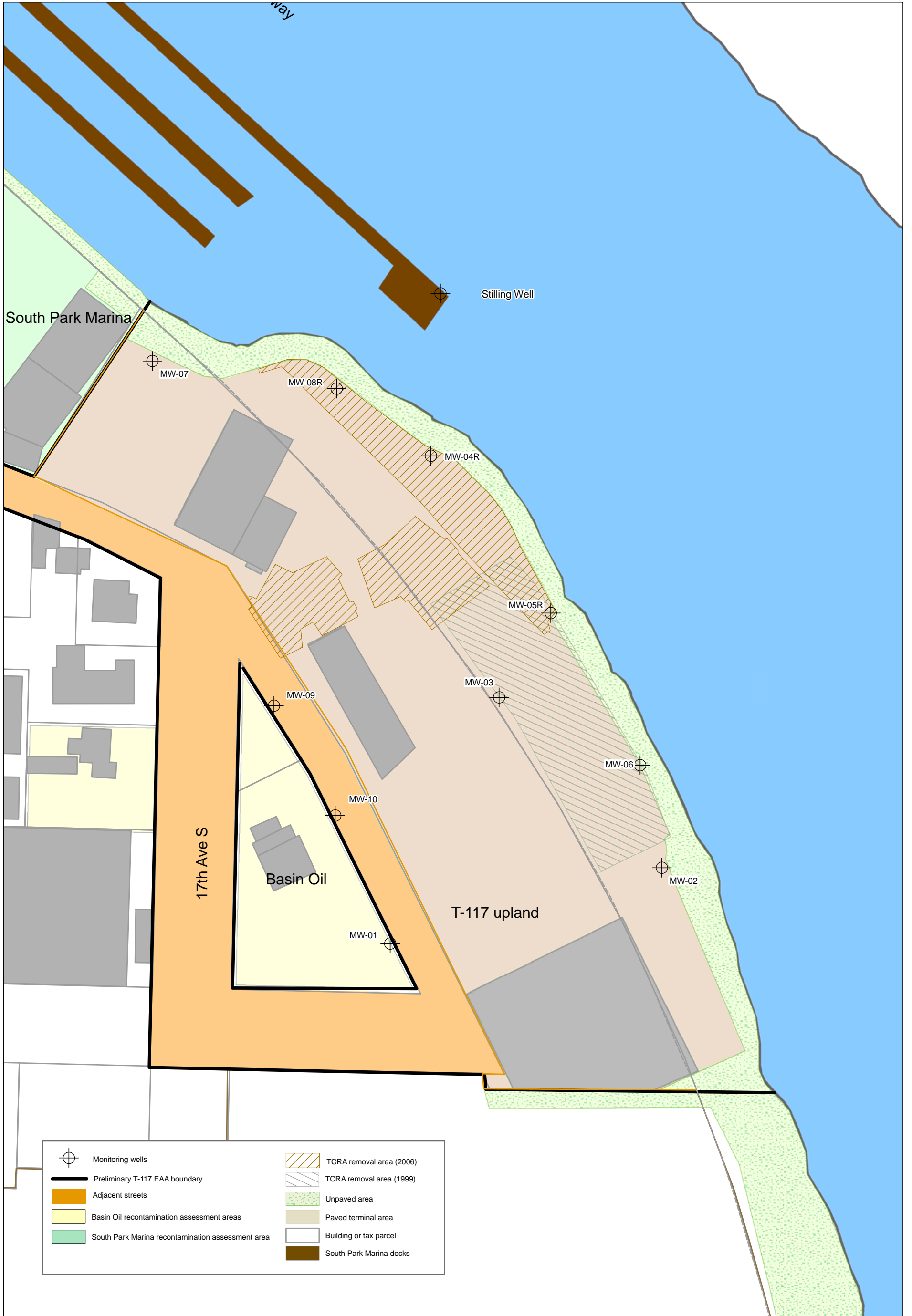
Figure 2. Site map